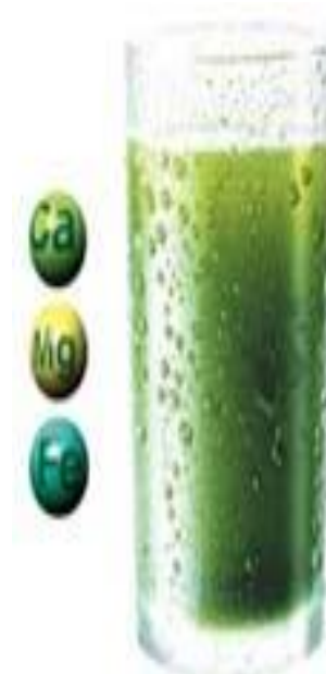
Figure 2. Wheatgrass juice

Wheatgrass is a vegetable, harvested prior to the plant forming the flower head. Wheatgrass packs a nutritional punch, including (per 3.5 grams) 860 mg protein, 18.5 mg chlorophyll, 15 mg calcium, 38 mg lysine, 7.5 mg vitamin C and an abundance of micronutrients, such as B complex vitamins and amino acids [2]. Phytochemical constituents of wheatgrass include alkaloids, carbohydrates, saponins, gum and mucilages. Its water soluble extractive value is found to be greater than its alcohol soluble extractive value. This is because of the chlorophyll content of wheatgrass, which is about 70% water soluble [1]. Wheat grass juice is high in vitamin K, which is a blood-clotting agent. People taking blood-thinning medications or people with wheat-related allergies shouldn't drink wheat grass juice without consulting a health care professional. Wheat allergies are generally a response to the gluten (a protein) found in the wheat berry [2]. Wheatgrass is available in form of extract, tablets (ready to use) and mixed juice (figures-2, 3)