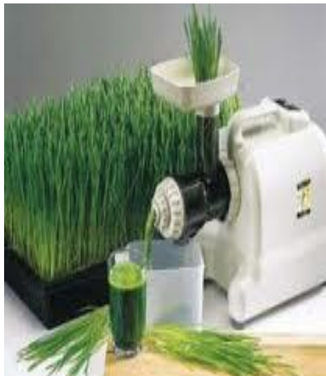
Figure 1. Picture of wheatgrass

survey of 1000 plants was completed, out of which 356 had clinical trials published evaluating their “pharmacological activities & therapeutic applications”. One of these plants, Wheatgrass, has been an integral part of Indian culture for thousands of years, and has been known to have remarkable healing properties. Scientifically known as Triticum aestivum , it belongs to Poaceae family. Other plants included in this family are: Agopyron cristatum , Bambusa textilis , cynodon dactylon , Poa annua , Zea mays , Aristida purpurea , etc. There is not much scientific data available on these plants because of a lack of substantial research. Therefore, it is important to study their properties to explore their maximum benefits. The cereal grasses- wheatgrass, barley, and alfa-alfa, have been known to boost health and vitality both in humans and animals. Wheatgrass’ culms are simple, hollow or pithy, glabrous, and the leaves are approximately 1.2 m tall, flat, narrow, 20-38 cm long and 1.3 cm broad [1]. The spikes are long, slender, dorsally compressed and somewhat flattened (figure 1).