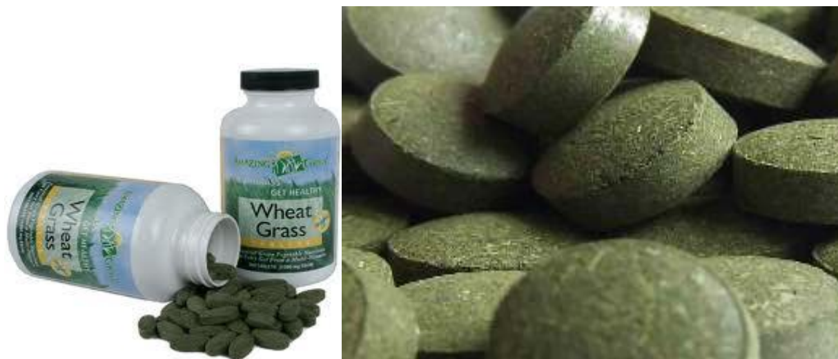
Figure 3. Wheatgrass Tablets